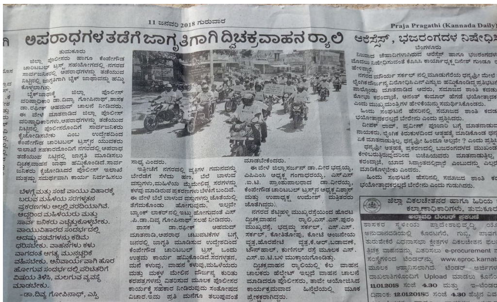
Local News paper item "Prajapragathi" on 11-1-2018