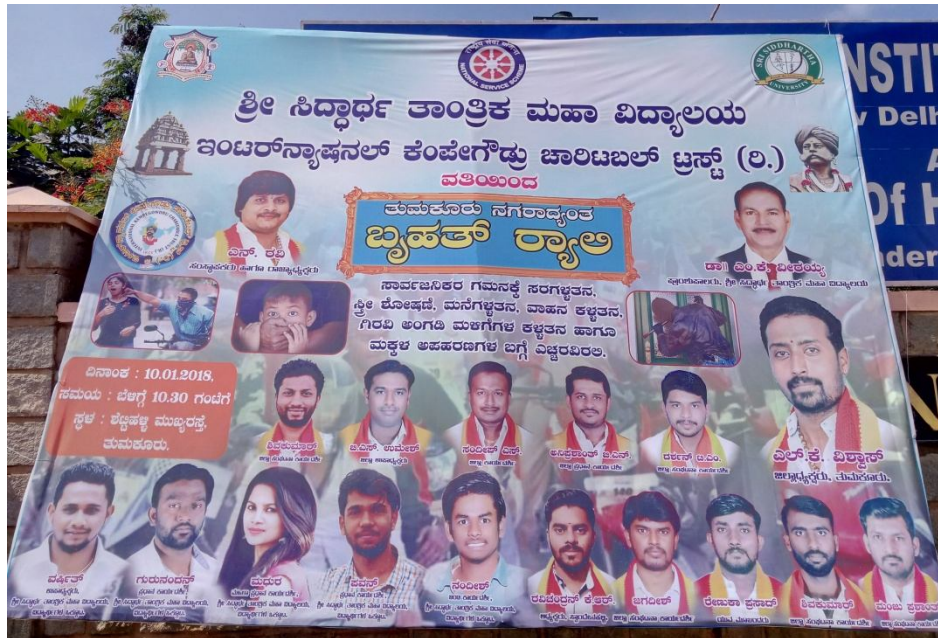
Flex Banner displayed at the Entrance of SSIT,Tumkur